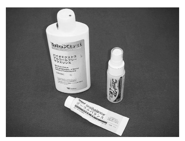
Fig. 4 Moisturizing agents