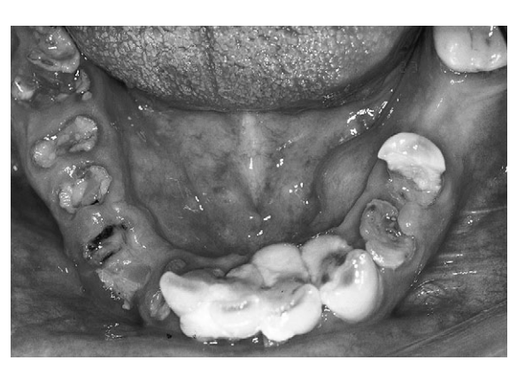
Fig. 3 Remaining roots after losing the crown portion

Inadequate oral cleaning can result in multiple and simultaneous cases of dental caries at the