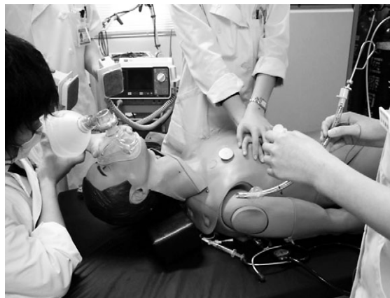
Fig. 2 Advanced cardiac life support training with use of Human Patient Simulator

hybrid model with the functions of altering vital signs according to the situation being simulated.