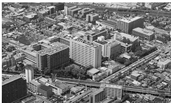
Fig. 1 Panoramic view of Osaka Medical College (OMC)