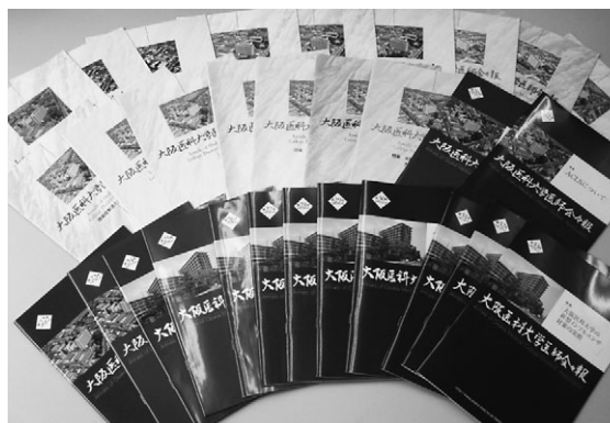
Fig. 2 Recent volumes of the Annals of the OMCDA