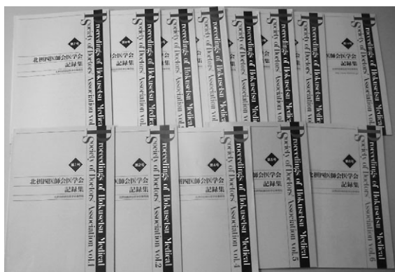
Fig. 3 Recent volumes of the Proceedings of the Hokusetsu Medical Society of Four Doctors' Association