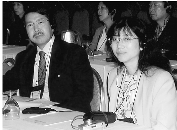
Fig. 1 The author and his wife at the World Medical Association 2002 General Assembly Scientific Session