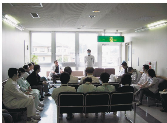
Fig. 2 A scene from the daily morning meeting (March 2011)

Every morning, a meeting was held to share information among the doctors, nurses, and pharmaceutical, examination, and radiology technicians, as well as managers, office staff, and representatives from nutrition departments ( Fig. 2 ). We were able to grasp the situation and understand transitions in vital information that changed day by day and hour by hour regarding stocks for test drugs, X-ray films, medicinal and food supplies, radiation levels, and so on. By requesting the presence of prefectural health division representatives, we were able to coordinate with hospitals, dispensing pharmacies, and medical associations to deal with mentally ill patients at the hospital and to restrict the dispensation of psychiatric drugs to a single specialist location in the city, even while telephone communication had not been reestablished and cars could not be used because of a lack of gasoline. In this way, we were able to fulfill our role as a key hospital in the Soma region without making any compromises under the system of cooperation with people in various lines of work inside and outside the hospital.