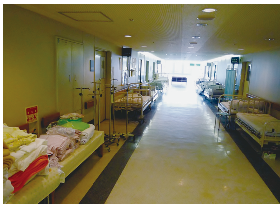
Fig. 1 A hospital ward that provided outpatient care after the disaster