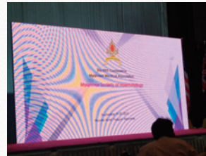
5 th Conference of Hematology Society