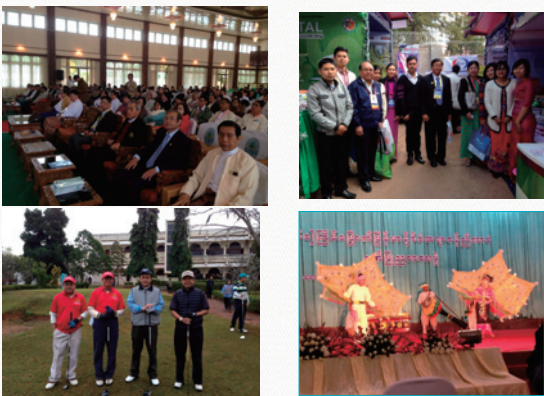
61 st Myanmar Medical Conference, Jan 2015, Taunggyi